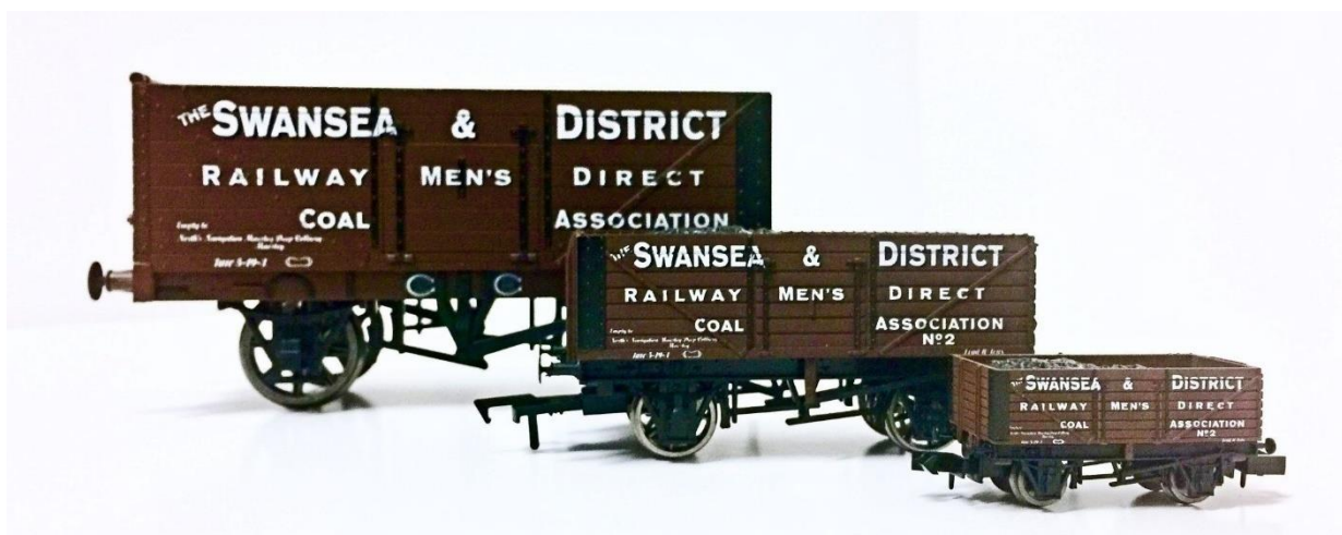
The club's 2020 show commission in all three gauges.

The profits from this sale go to SRMG but, as stated, the run is now sold-out.