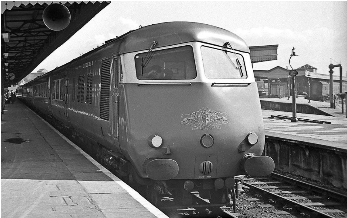
A magnificent photograph of the South Wales Pullman, seen at Platform 4 of Cardiff General in 1966. Photo by Robert Masterman and gratefully acknowledged.