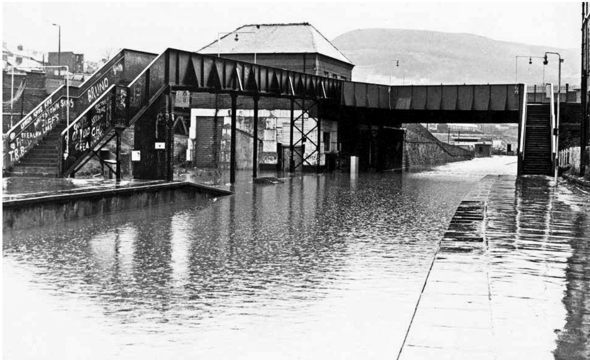
A remarkable photograph of Tonypany Station taken during the floods of 1979. One wonders what the members of the 'Wattstown Skins' are doing now?

Most will have noticed that 'Box', our large N gauge exhibition layout, is now nearly complete: very little scenic detailing remains to be undertaken and the wiring-up will commence shortly. However, thought also needs to be given to safely transporting the layout to our 2019 show [and others]. A van will be hired [probably] but a timber skeleton framework will also be required to contain the larger sections without them being damaged in transit. Mal Shore has kindly agreed to lead on this but has asked for the assistance of at least one other competent carpenter to lighten the load. This is an important task and help from others would be very greatly appreciated. Please speak to Mal directly if you feel that you can assist. Many thanks.