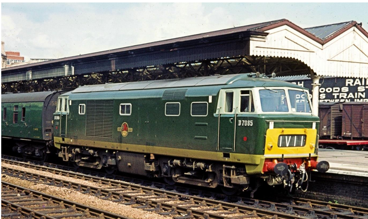
A stunning photograph taken in July 1963. Hymek D7085 is heading a rake of SR green-liveried Mk 1's on the mid-day SO Portsmouth & Brighton to Swansea, calling at Newport High Street at 16.15. A useful reference photo for weathering that pristine Heljan Hymek you have safely boxed away, too.